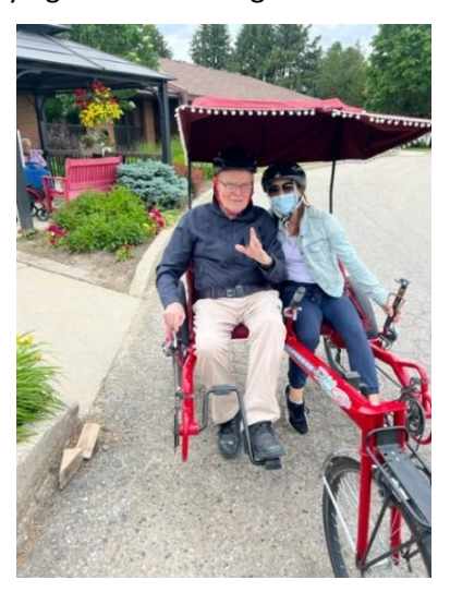
Enjoying our bike during the nice weather